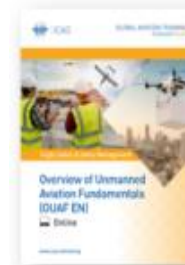
Overview of Unmanned Aviation Fundamentals