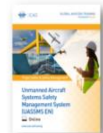
Unmanned Aircraft Systems Safety Management System