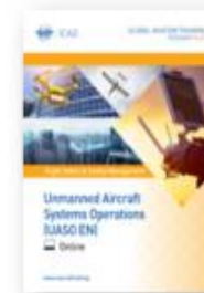
Unmanned Aircraft Systems Operations