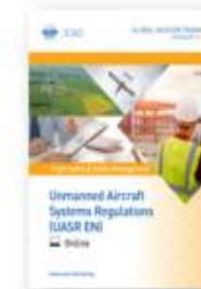
Unmanned Aircraft Systems Regulations